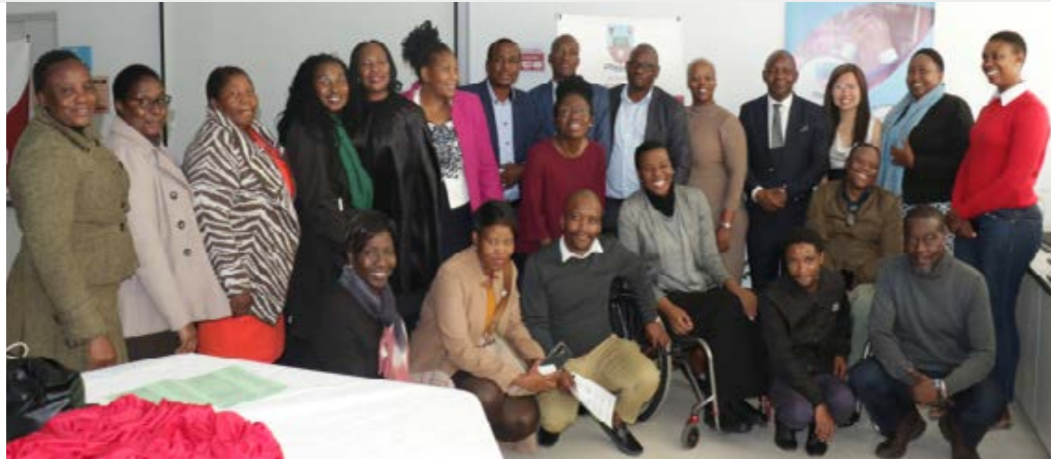
The workshop brought together participants from different backgrounds around the country.

interrelated themes: Agri-Food systems; Water, Energy, and the Environment; Culture; Youth Empowerment; Education; Health and Nutrition. ■