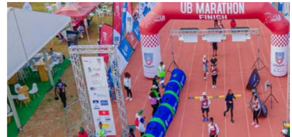
The second edition of the UB Marathon is expected to attract more than 3000 runners.

purchase with prices ranging from P1500 to P15 000. Runners could register across different categories (42km, 21km, 10km & 5km fun run). Meanwhile, the marathon aimed to further afford the more than 80 000 UB alumni a great opportunity to reconnect with their alma mater.