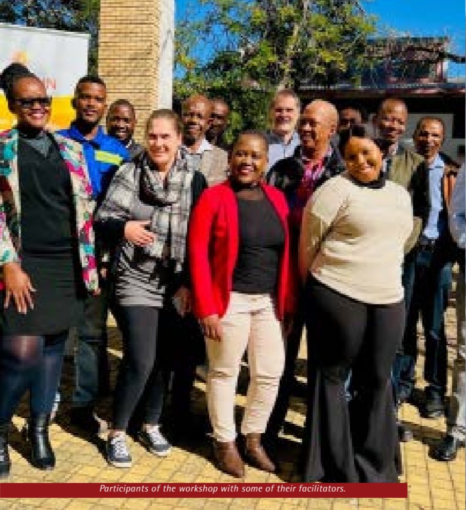
Participants of the workshop with some of their facilitators.

SOLTRAIN+, the new phase of the Southern African Solar Thermal Training and Demonstration Initiative held a training workshop for the industry and academia on energy efficiency measures and design of thermal energy systems.