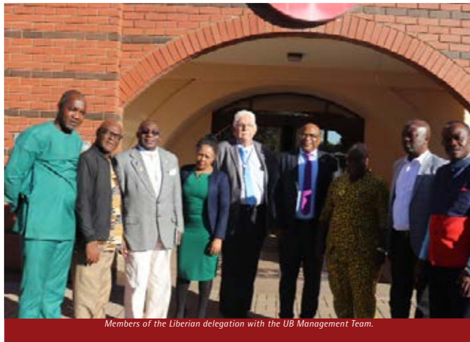
Members of the Liberian delegation with the UB Management Team.

The nine Liberian students are set to return home by end June 2023. The group enrolled for Masters degree programmes as part of an initiative to capacitate Liberia's human capital besides transforming the country's education system. ■