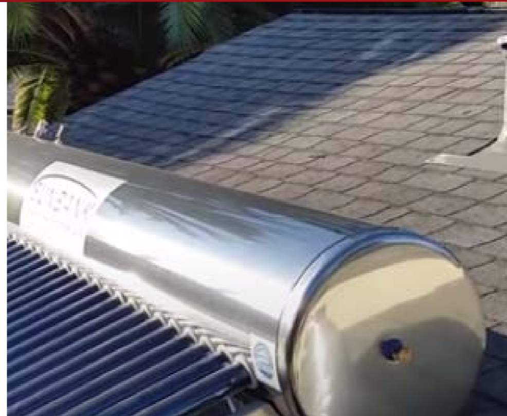
Water heating solar system