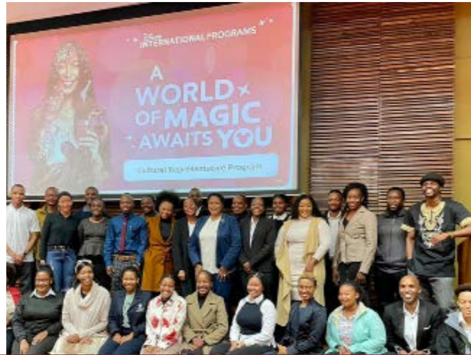
Fancing their chances at the Walt Disney Company's Orlando Florida themed park.

Walt Disney Company on plans to formalise collaboration by way of signing a Memorandum of Understanding (MoU).