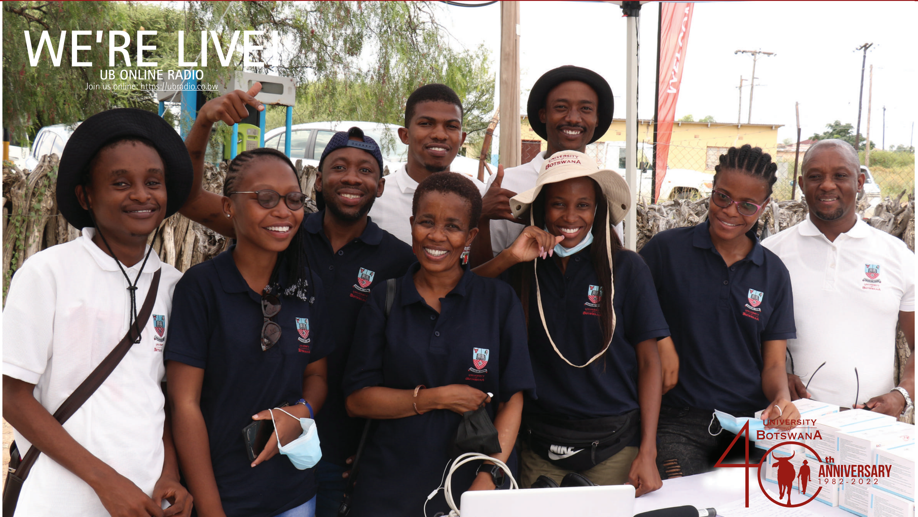
UBRadio hosts with some members of staff of the Department of Media Studies during World Radio Day held at Letlhakeng on February 11, 2022. The theme for this year was: Radio and Trust

UB ONLINE RADIO Join us online: https://ubradio.co.bw