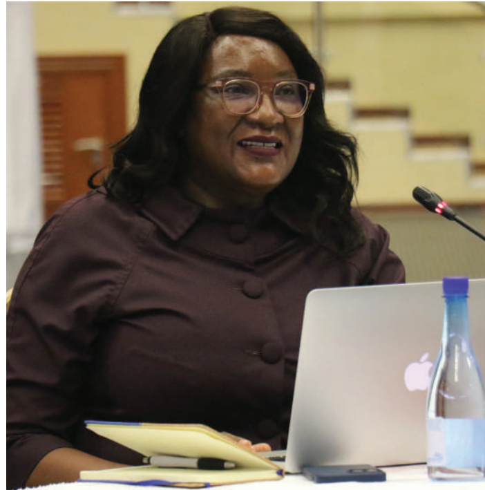
Industrial Court judge and IAWJ Botswana Chapter representative, Justice Annah Petje.

The project follows a partnership the Law Department entered into with the International Association of Women Judges (IAWJ) and its Botswana Chapter in November 2020. Since commencement of the project 18 months ago, the department has conducted three human rights seminars during which students were trained on the Yogyakarta principles, a set of human rights imperatives for LGBTI people. Landmark cases on LGBTI rights have also been discussed in addition to conducting two moot