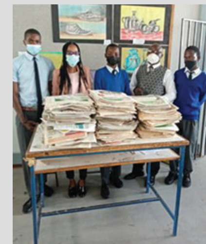
Students and staff receiving the newspapers.

They noted that the donations were timely given that they needed material to set questions from stories from old newspapers as well as to guide students on how to answer questions across subjects. Both the Art students and teachers thanked ORI for the donation and asked for more.