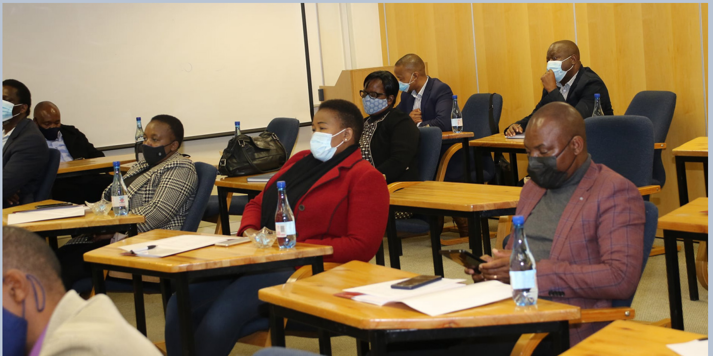
Some of the participants of the workshop which the Faculty of Business organised

The Faculty of Business in conjunction with the Accountant General's Office in the Ministry of Finance and Economic Development has brought together senior managers in the public sector for a week-long annual East and Southern African Association of Accountant Generals (ESAAG) workshop at the University of Botswana.