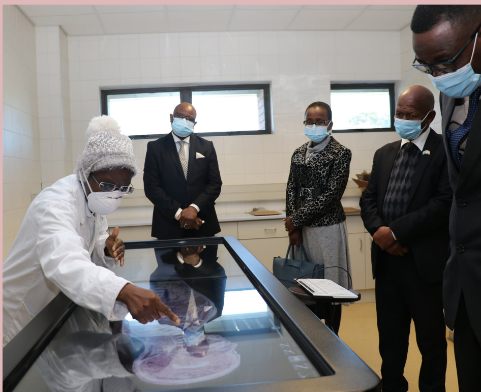
Members of the Parliamentary Portfolio Committee on Education and Skills Development on a tour of the University of Botswana research and training facilities.

The Parliamentary Portfolio Committee on Education and Skills Development has expressed confidence that the University of Botswana has potential and capacity to help Botswana transform into a knowledge-based economy.